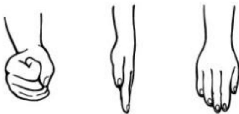
Fig. 2. Hand position during exercise “Fist- edge-palm”

involves the following sequence of actions: put hands on the table; one balled in a fist, the other lies on the table with his palm; at the same time change the position of the hand (if right fist and left hand palm, then change to the right – hand, left – fist, and so on). Another of the effective exercises on this list is called “Fist- edge-palm”.