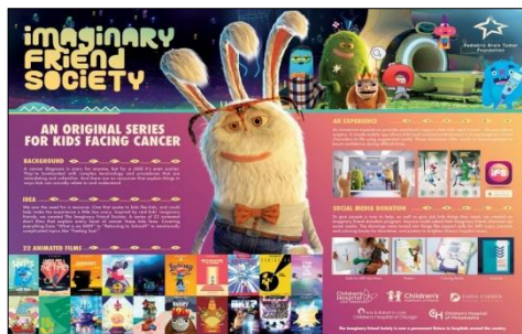
Fig. 2. Advertising materials for the Imaginary Friend Society campaign 52

Thus, the affective approach by RPA defined the use of resonance advertising and emotional methods. The logical combinations of various appeals promoted the utilization of the advertising messages. The manner of executional framework based on the insight on how children see the world helped translate abstract and foreign concepts into approachable stories, events and characters. All these advertising techniques in combination with well-planned communication strategy ensured the success of the Imaginary Friend society integrated campaign.